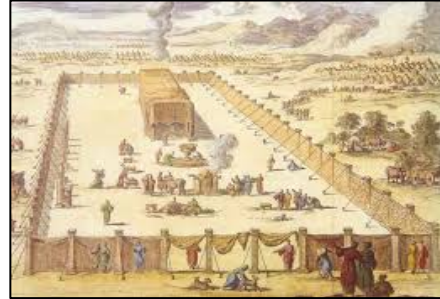
The Witness of Heaven on Earth